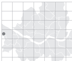
> Map: A-7 (p.019)