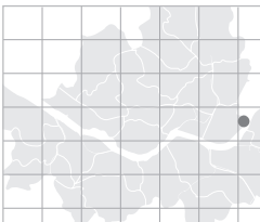
> Map : M-7 (p.019)

175 Achaseong-gil, Gwangjin-gu, Seoul, Korea